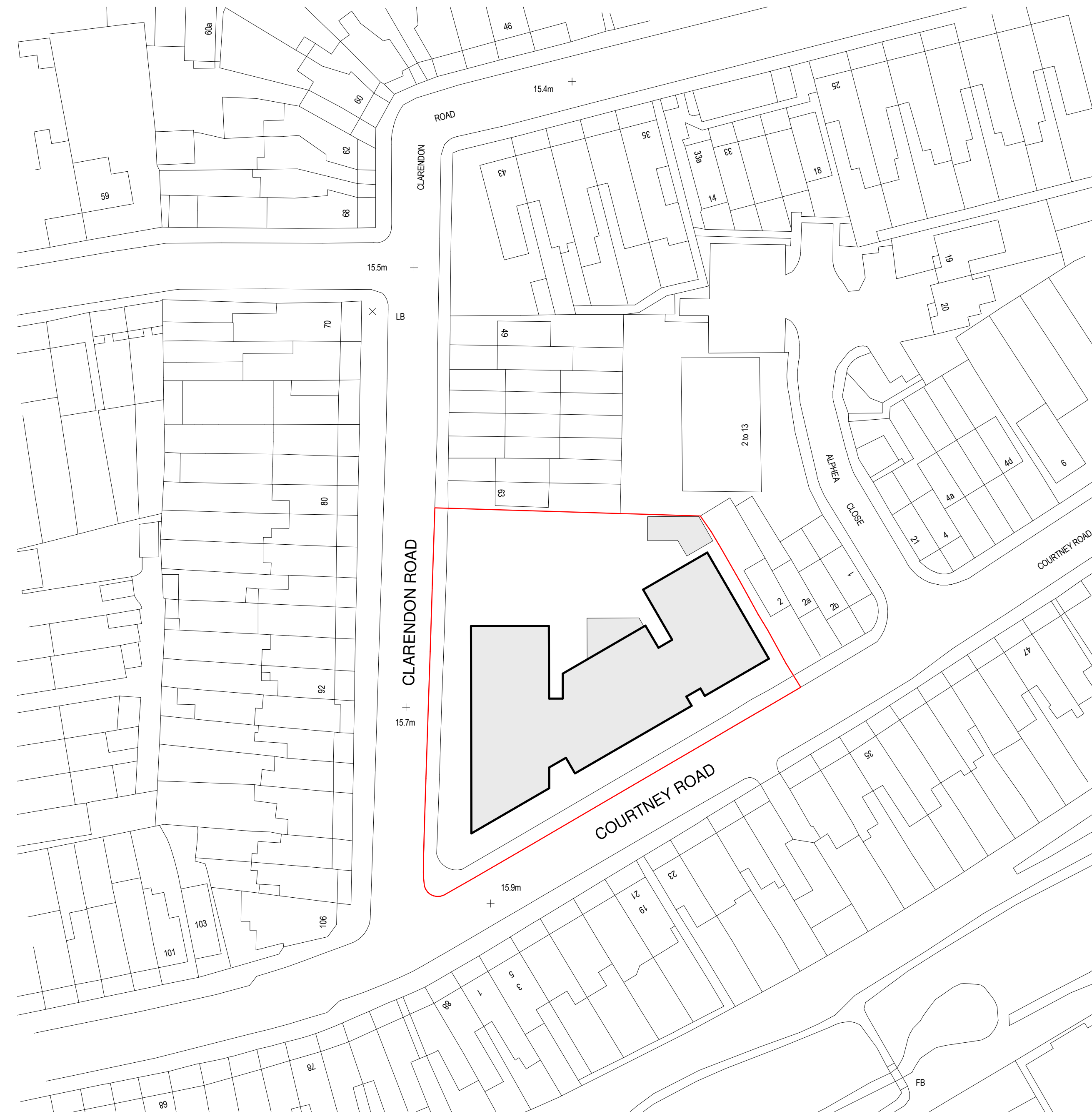
Block Plan 1: 500